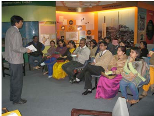
(training session for teachers :National Science Centre in New Delhi)

After this, teachers will have the possibility to work with the education team of the museum.