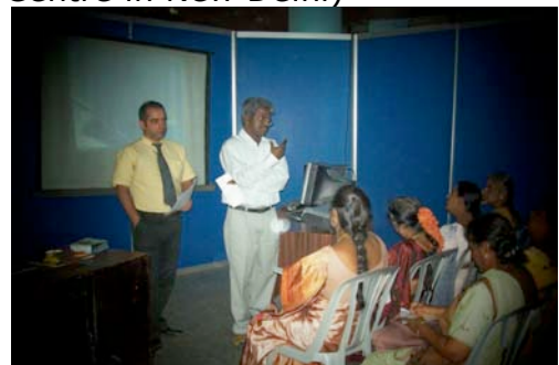
(training session for teachers : Visvesvarya Industrial & Technological Museum in Bangalore)