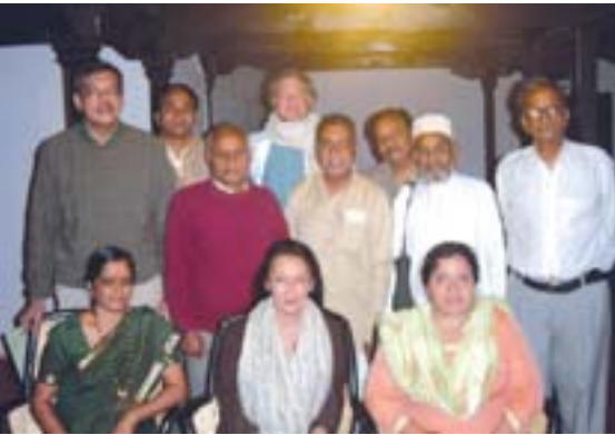
Maheshwar Partnership Meeting, 15 Dec. 2007

a Bhopal-based association which was formed with the objective of developing the City of Maheshwar as