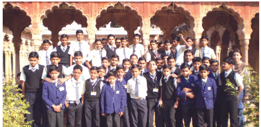
Heritage Walk: Bhopal School children participating in the Heritage Walk

The Jodhpur RIFF, supported by UNESCO as a peoples' platform for creativity, highlights the region's important cultural assets – the singers, dancers, instrumentalists and storytellers of more than 15 Rajasthani folk communities, many unknown to the outside world. Joining them will be performing artists of national and international standing, making the Jodhpur RIFF a unique combination of local and world music. The Jodhpur RIFF was inaugurated last year in October and received international critical acclaim for being one of the best events in the world music calendar. The festival