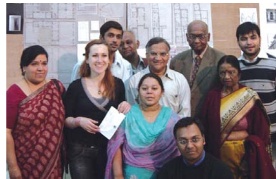
Participants at the Indo French Gwalior Exhibition

Maheshwar Partnerships is a venture of the Living Heritage Alliance,