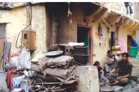
Jaipur Heritage Walk : Chowkri Modikhana Local Metal crafts ( thatera ) are still practiced in Chowkri Modikhana

projects are envisaged to support economic regeneration of the area. These are a crafts museum for the local craftsmen ( thateras ), local cafes, bed and bath facilities, a heritage house, a solid waste project with community participation as well as privately initiated interventions such as a bed & bath cluster, a cafe and a house of heritage.