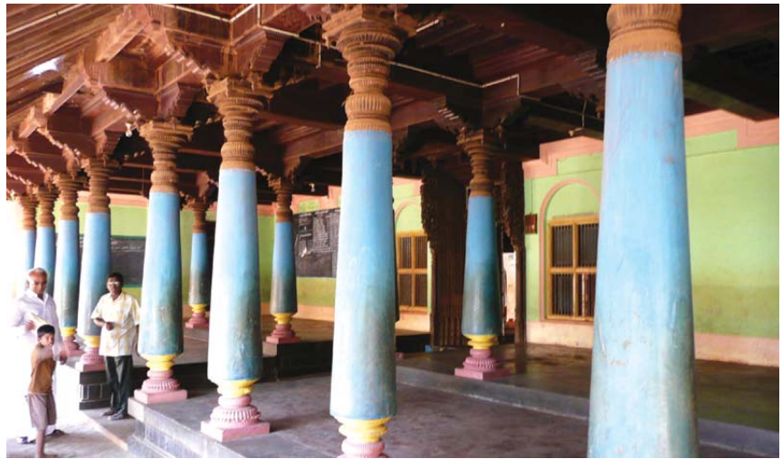
Heritage House, Chettinad

A key event was the seminar on "Planning and Management of Built Heritage in Chettinad" held from 21 to 23 January 2008 in Chennai, jointly organized by the above mentioned partners, for administrators and