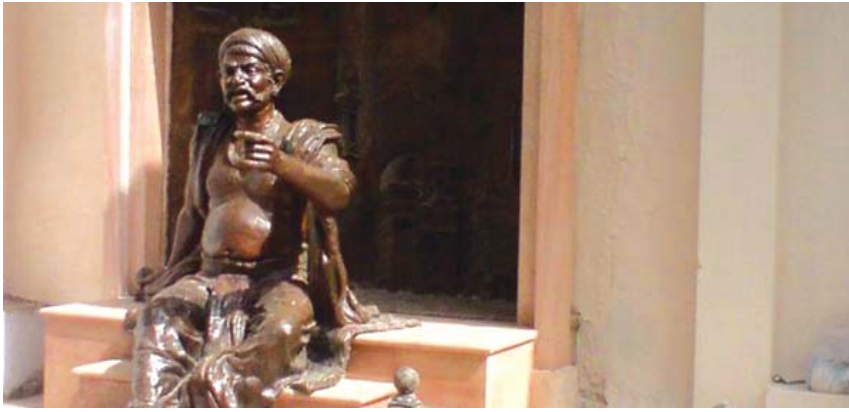
Akha Bhagat Chowk after restoration

'Recommendations for the Conservation and Revitalization of the Walled City of Ahmedabad'.