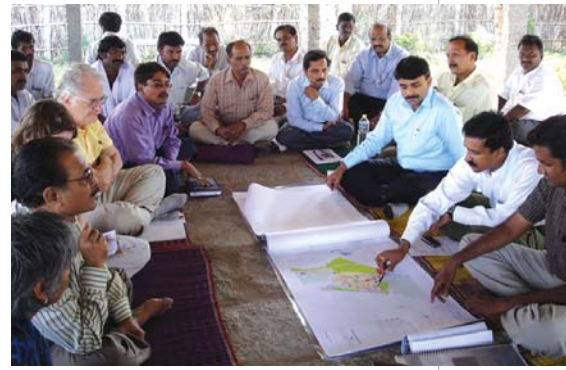
Panchayat consultation for the Hampi World Heritage Master Plan

And finally, in order to discuss all existing initiatives and to bring the experience gained and lessons learned to a higher level and share the best practices with the global tourism constituency, UNESCO (New Delhi Office and the World Heritage Centre) will be organizing an International Experts Meeting on World Heritage and Sustainable Tourism in March 2009 in India. This meeting aims to develop practical methodologies in implementing international chartres and standards on sustainable tourism by moving theory into practice. UNESCO is currently looking for a venue in a cultural or ecological tourism destination in India and a generous co-financing partner to host some 30 international and national experts. More details will be shared with you on www.ihcn.in .