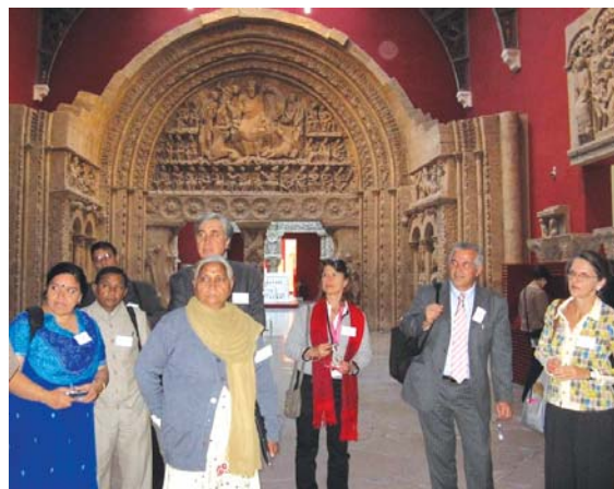
Participants in the Mayors' Study Tour to France