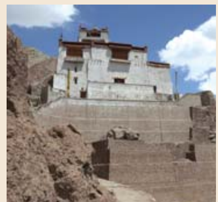
Maitreya Temple, Ladakh

The UNESCO Asia-Pacific Heritage Awards for Culture Heritage Conservation, managed by UNESCO Regional Office for Asia-Pacific based in Bangkok was established to recognize the achievement of individuals and organizations, within the private sector and public-private initiatives, in successfully restoring structures of heritage value in the region.