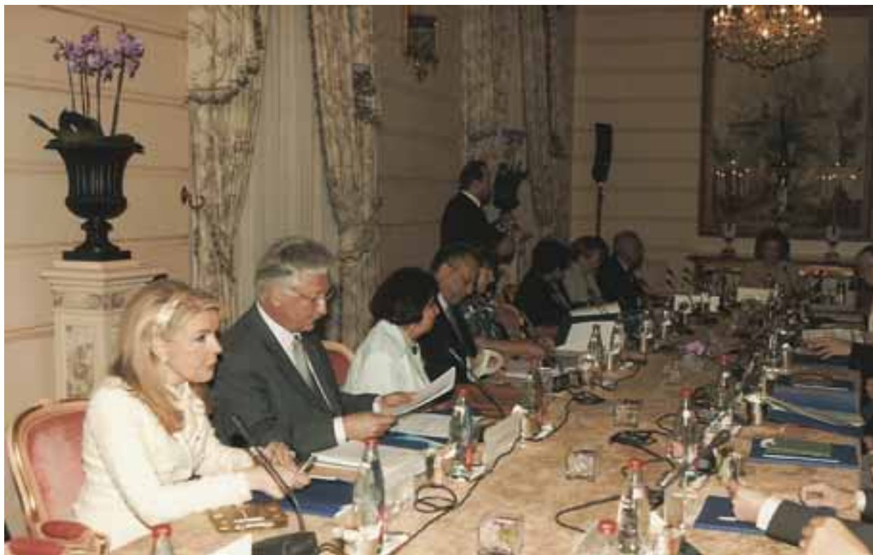
The meeting presided by Mrs. Suzanne Mubarak.