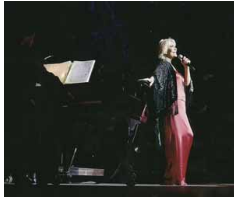
Marinella singing for ELPIDA