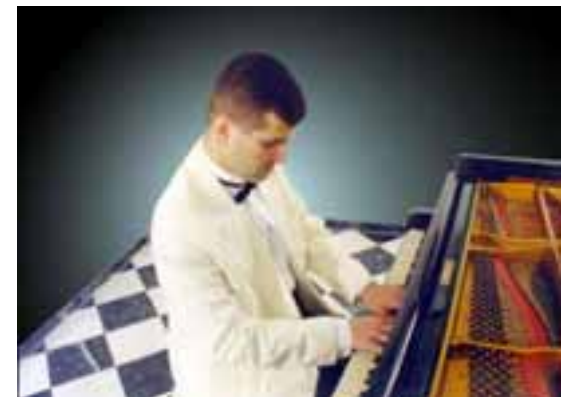
Solist: Dimitris Sgouros