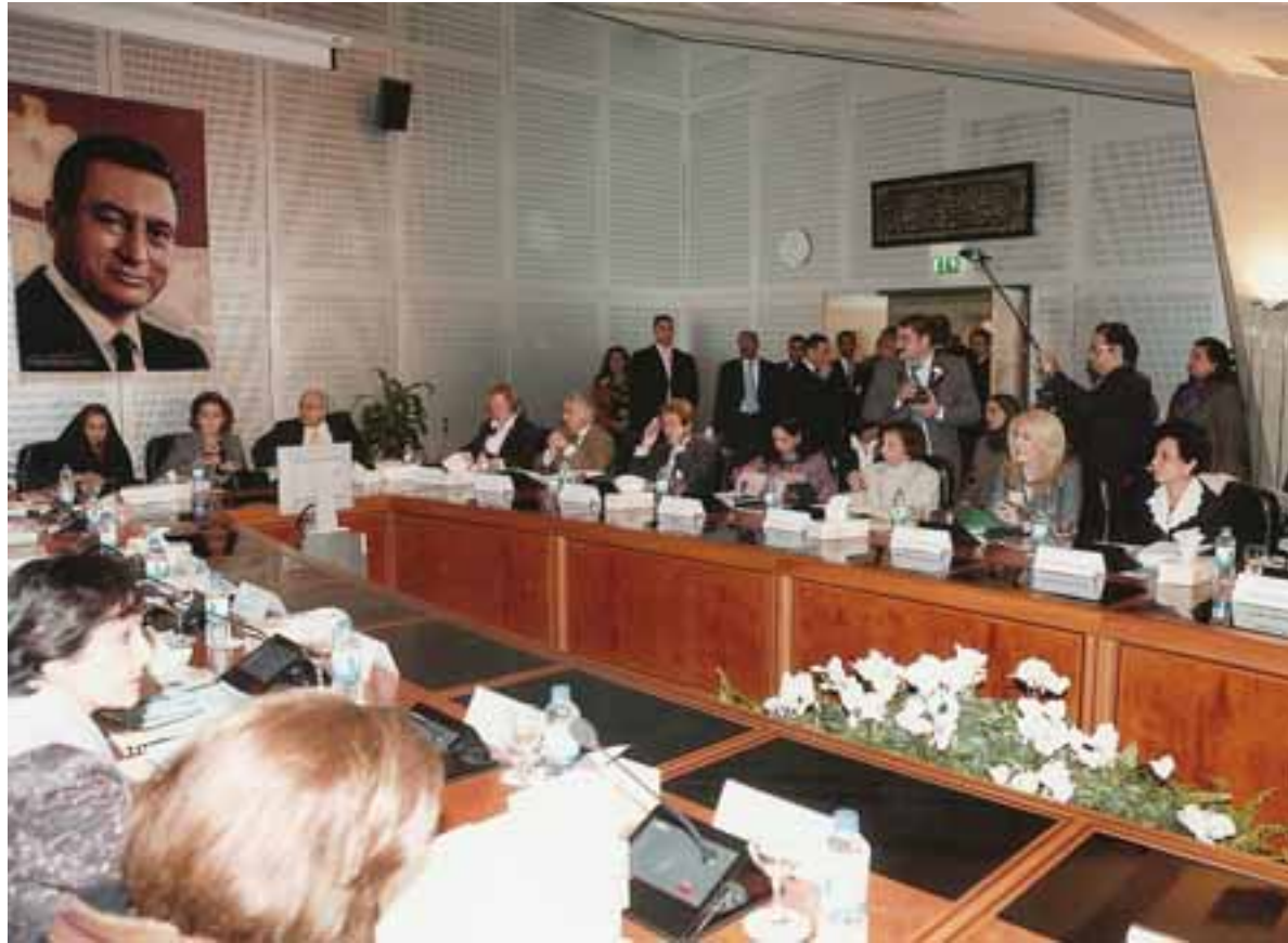
The meeting presided by Mrs. Suzanne Mubarak.