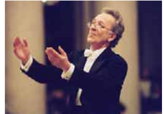
Director: Yuri Termirkanov