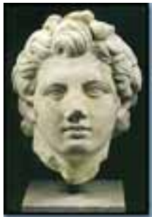
Alexander the Great