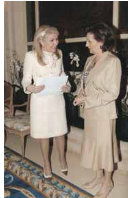
The President of the SMWIPM, Mrs. Mubarak, receives the funds raised in the dinner by Mrs. Vardinoyannis, to the support of the global campaign “End Human Trafficking Now!”